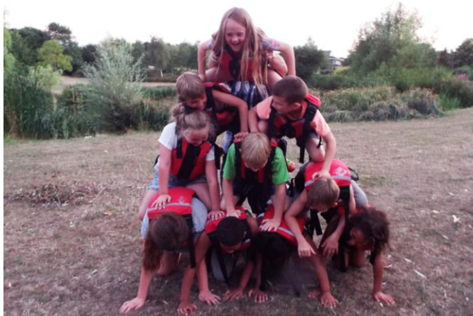
The human pyramid